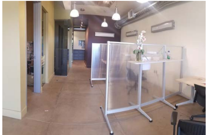
common work area