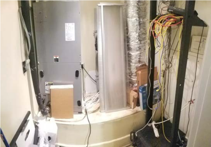
utility closet / tech room