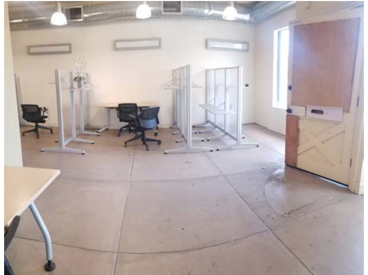
common work area