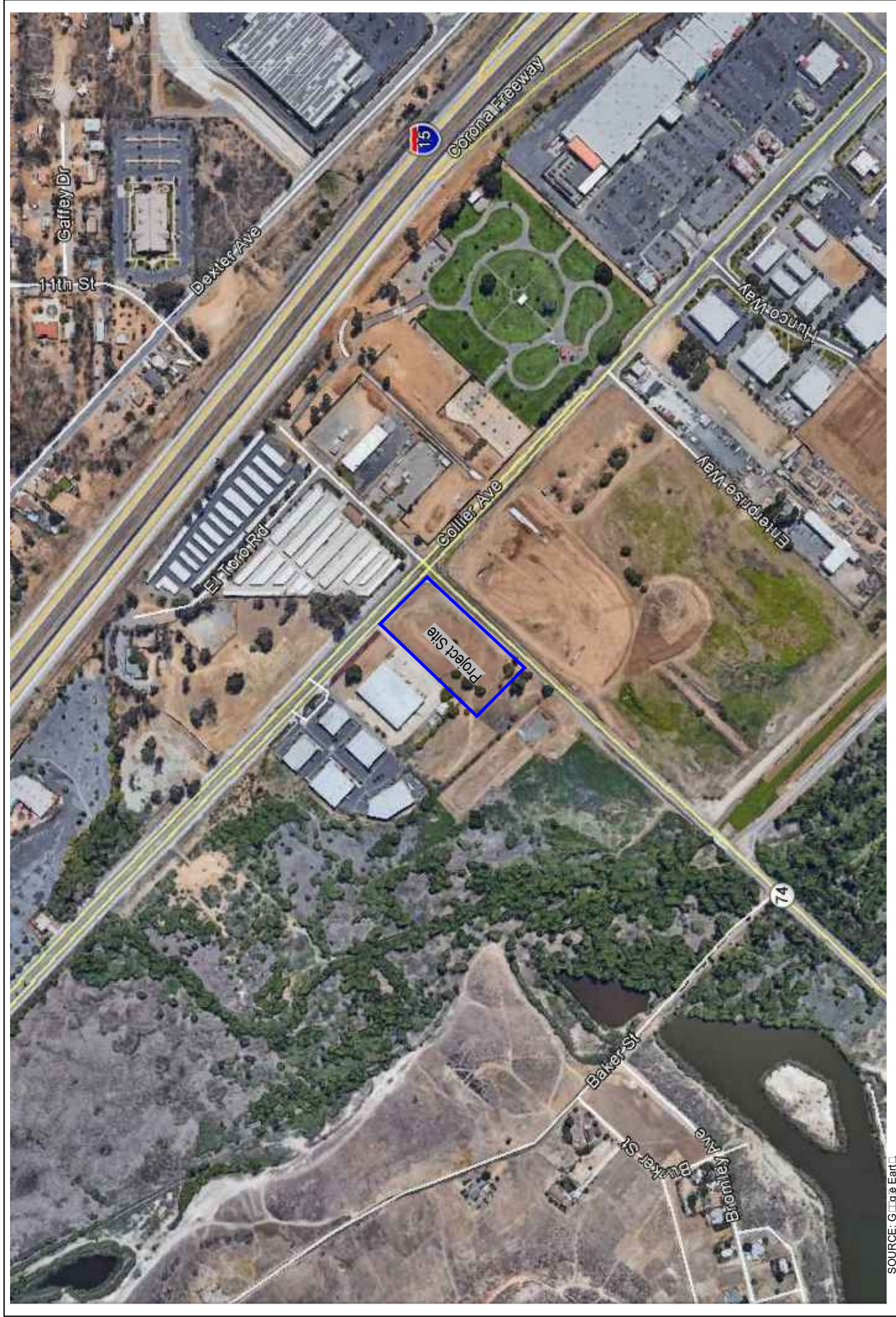
Figure 1 Project Local Study Area