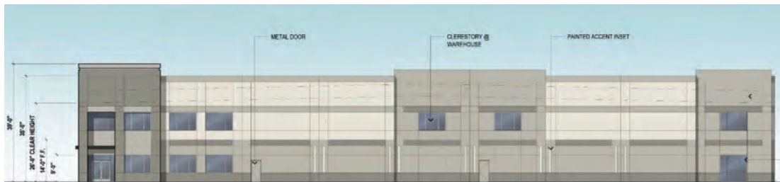
EAST ELEVATION( CHANEY ST. ELEVATION)