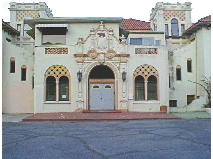
Historic Naval & Military School