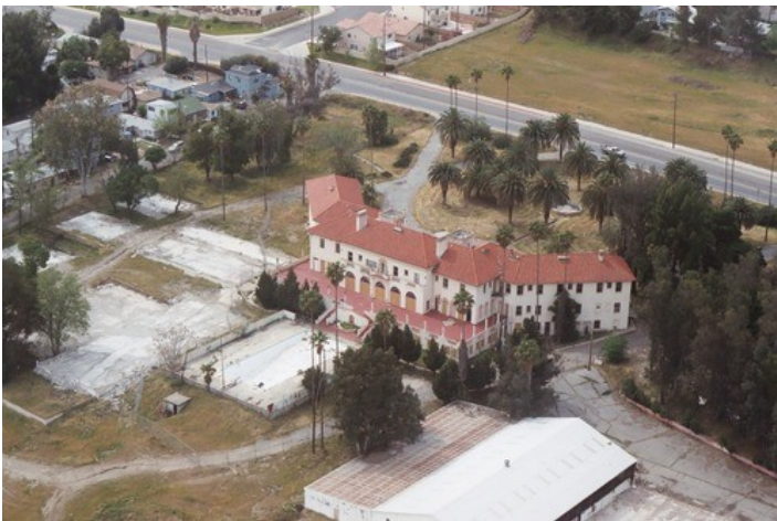
Historic Naval & Military School