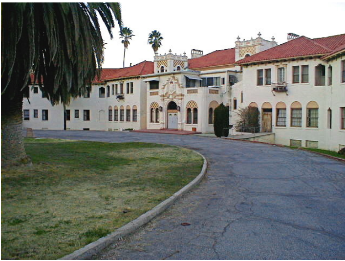
Historic Naval & Military School