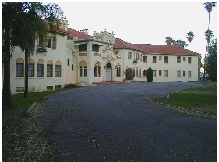
Historic Naval & Military School