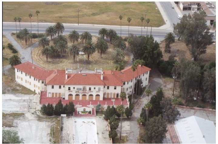
Historic Naval & Military School