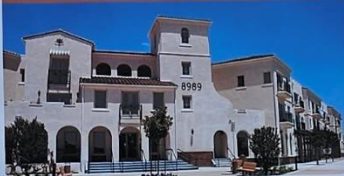
Affordable Housing Viviendas Asequibles