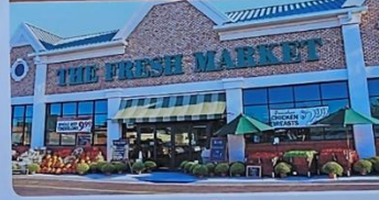
Grocery Store/Healthy Food Supermercado/Comida Saludable