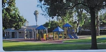
Parks/Recreation/Community Center Parques/Recreación/Centro Comunitario