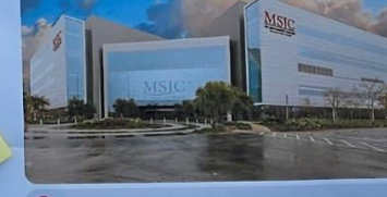
Community College/Trade School Colegio Comunitario/Escuela de Oficios