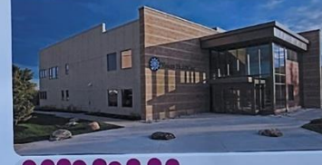
Medical Office/Hospital Consultorio Medico/Hospital