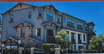
Multi-Family Housing Viviendas Multifamiliar

Choose your top three priorities by placing a dot on the gray boxes | Elige tus tres prioridades principales colocando un punto en los cuadros grises