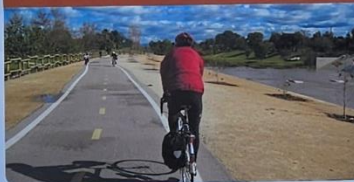
Bike/Pedestrian Infrastructure Infraestructura para bicicletas/peatones