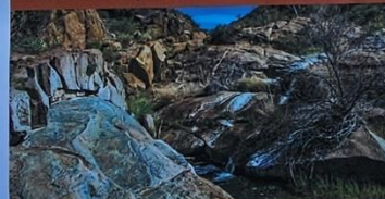
Conservation/Open Space/Habitat Conservación/Espacios Verdes/Habitat